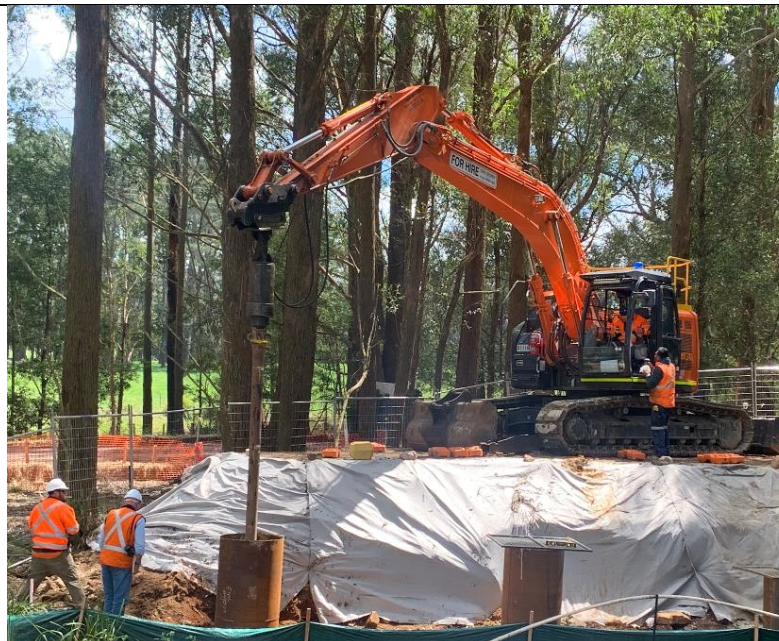
PN061 – ZX225-5