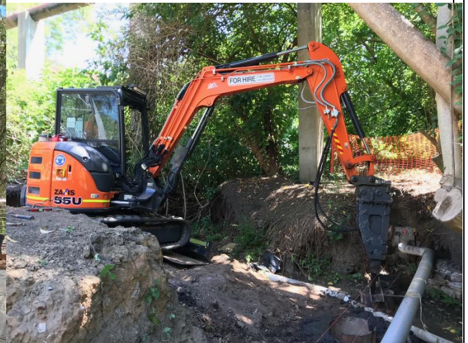
PN055 – ZX55U-5a