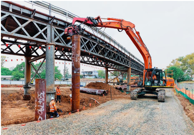
PN056 – ZX260-5